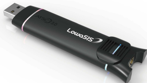
ATSC 3.0 Dongle